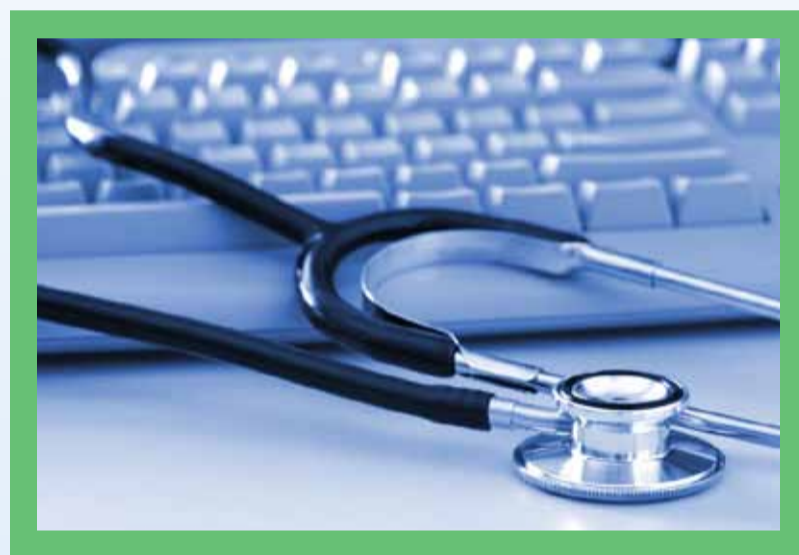
Primary health care