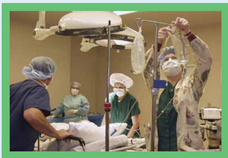
Access to elective services